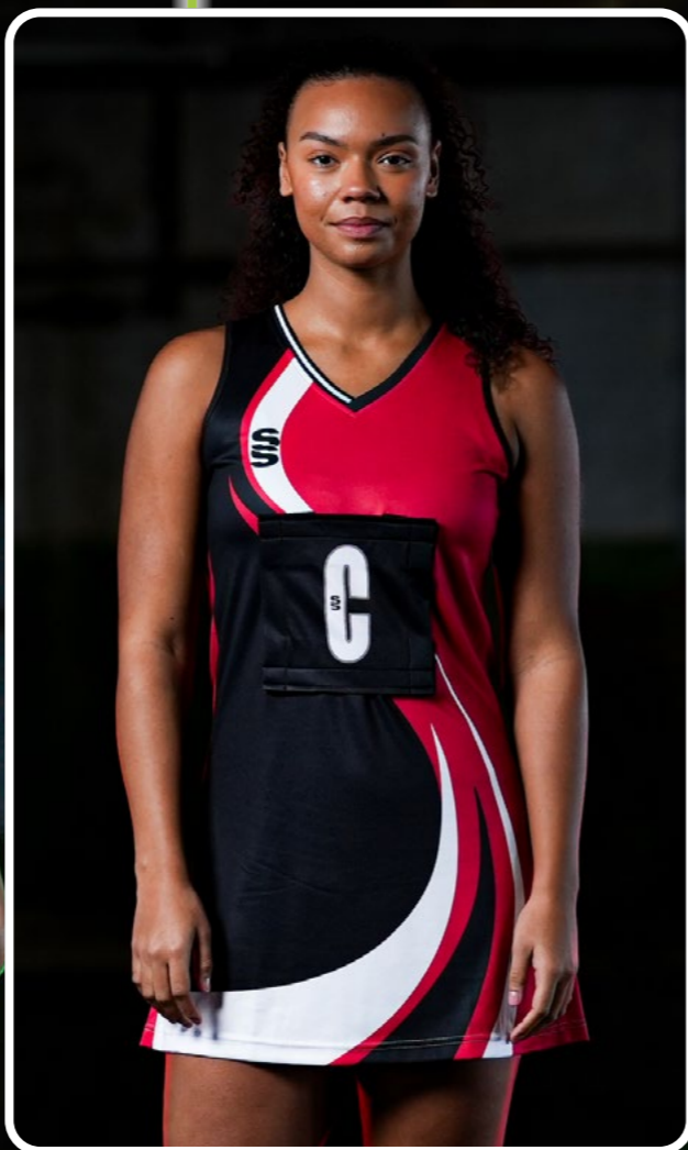
Twist Range Red/White/Black