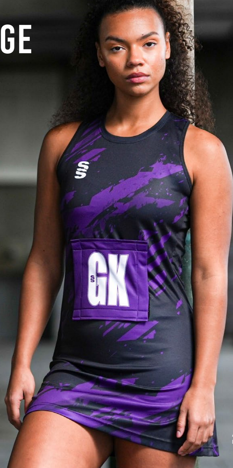
Attack Range Purple/White/Black