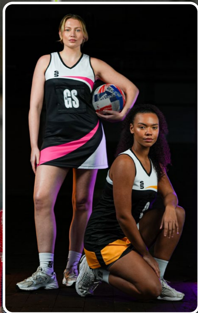
Shield Range Pink/Black/White Amber/Black/White