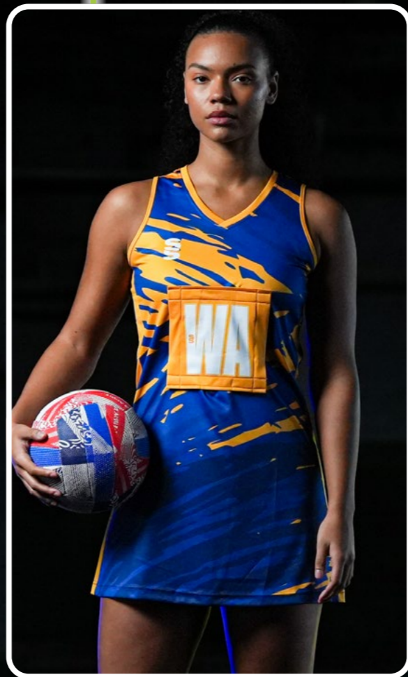
Power Range Royal/Amber/White