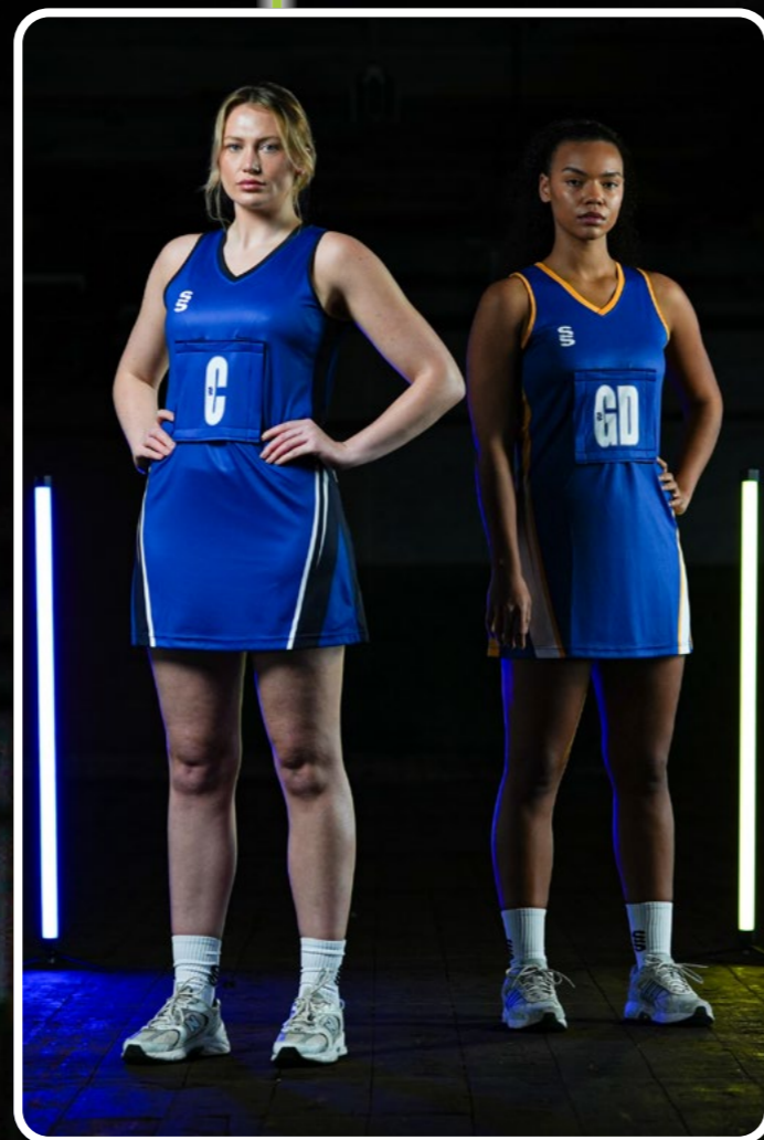
Replay Range Royal/Navy/White Royal/Amber/White