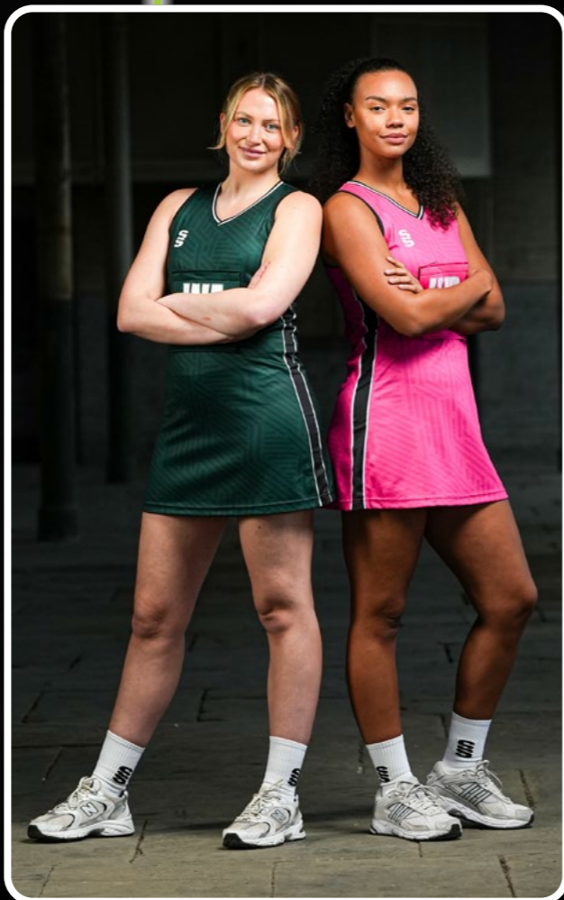
Dodge Range Bottle/Black/White Pink/Black/White