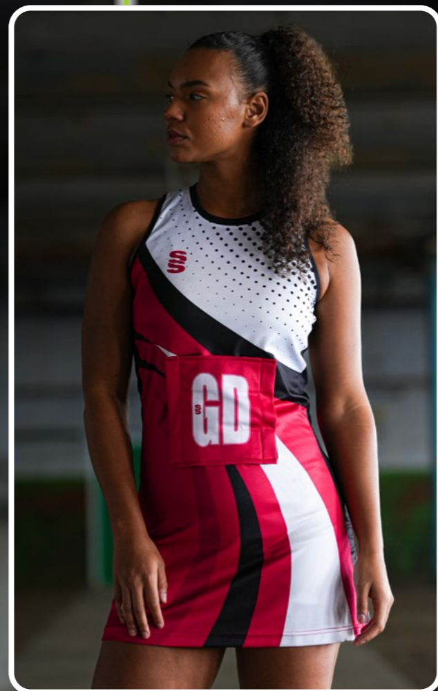
Pivot Range Red/White/Black