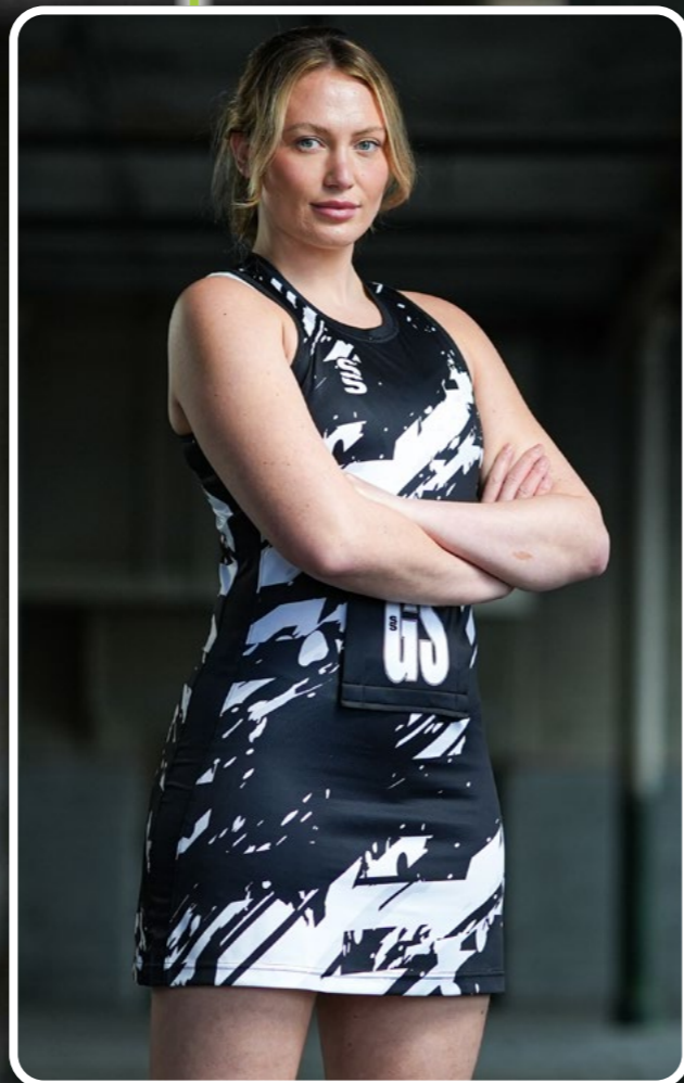
Attack Range Navy/White