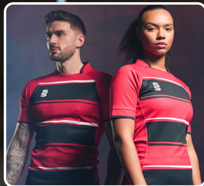
Blindside Range Red/Black/White