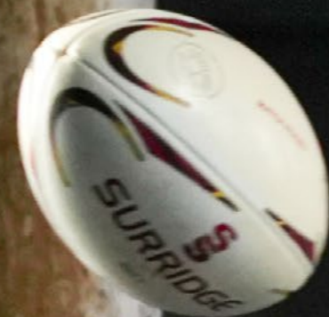
Advantage Range Royal/White