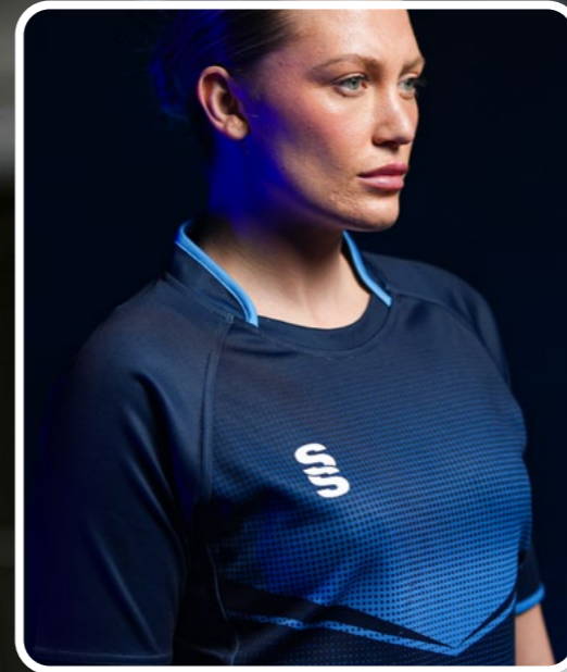
Focus Range Sky/Navy