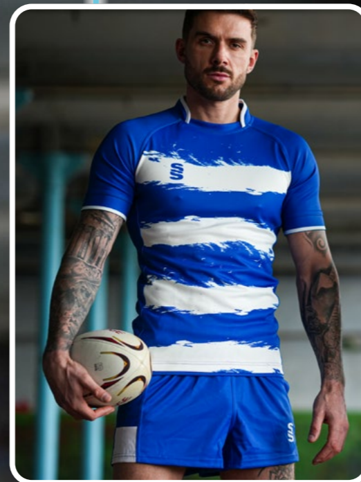
Haka Range Royal/White