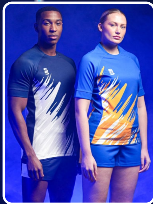
Blitz Range Navy/White Royal/Amber/White