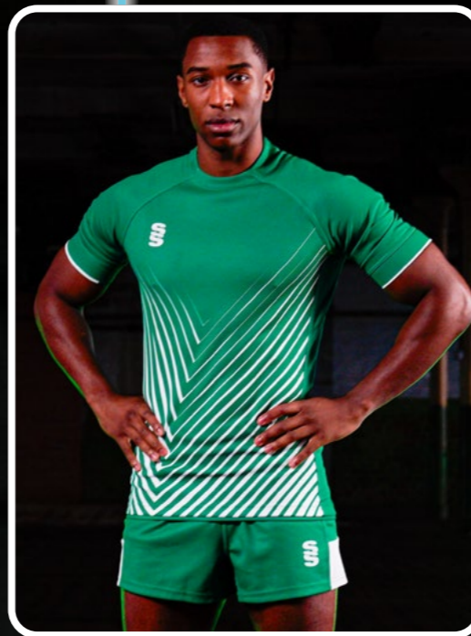
Lock Range Emerald/White