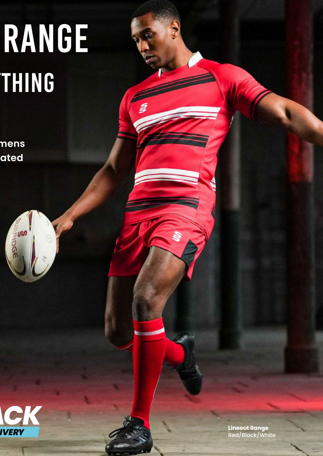
Lineout Range Red/Black/White

Complete your design by adding SurrIDGE Sports bespoke or stock range of rugby shorts and socks.