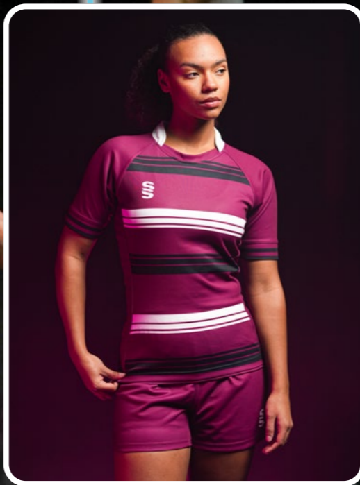
Lineout Range Maroon/Black/White