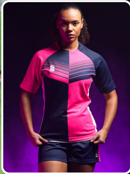
Turnover Range Pink/Navy/White