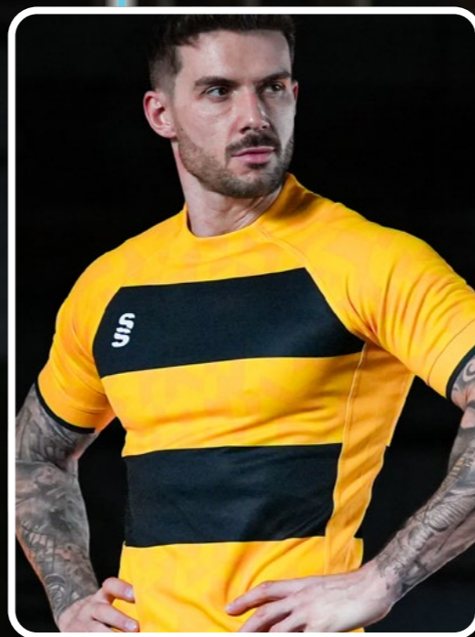
Rugger Range Amber/Black/White