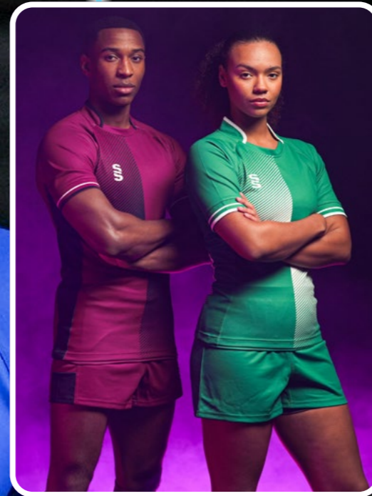
Advantage Range Maroon/Black/White Emerald/White